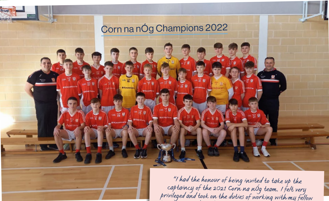
Corn na nÓg Champions 2022

"I had the honour of being invited to take up the captaincy of the 2021 Corn na nÓg team. I felt very privileged and took on the duties of working with my fellow teammates and coaches with the hope of bringing our team to success, and we did just that. When the final whistle blew emotions washed over me, one after the other, relief, happiness, excitement, accomplishment and I felt proud of my teammates, coaches, teachers and myself. I may have started out in first year as a sub on the B-team, but once I began to gain confidence and work harder, I helped lead my team to victory in the end. Being part of this team enhanced my belief in myself and instilled great determination which as improved my overall life skills and helped me communicate with teammates, helping to bring us together with a vision and an aim for success."